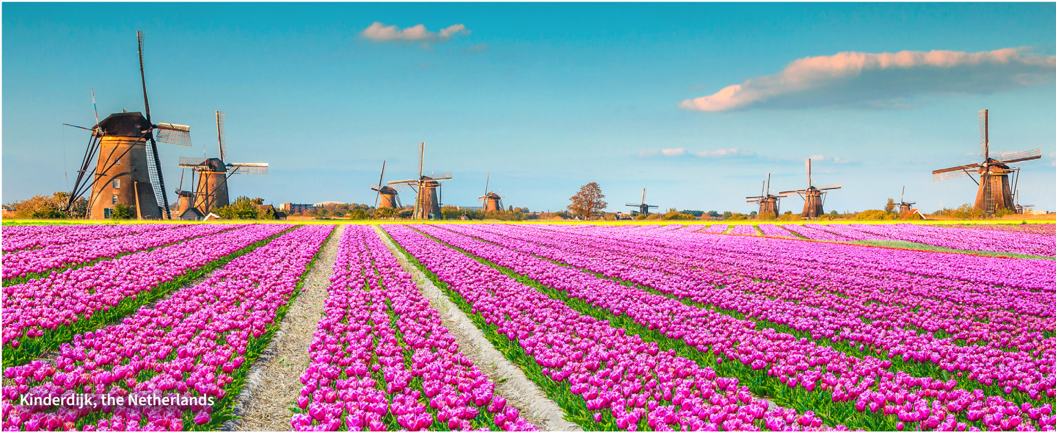
Kinderdijk, the Netherlands