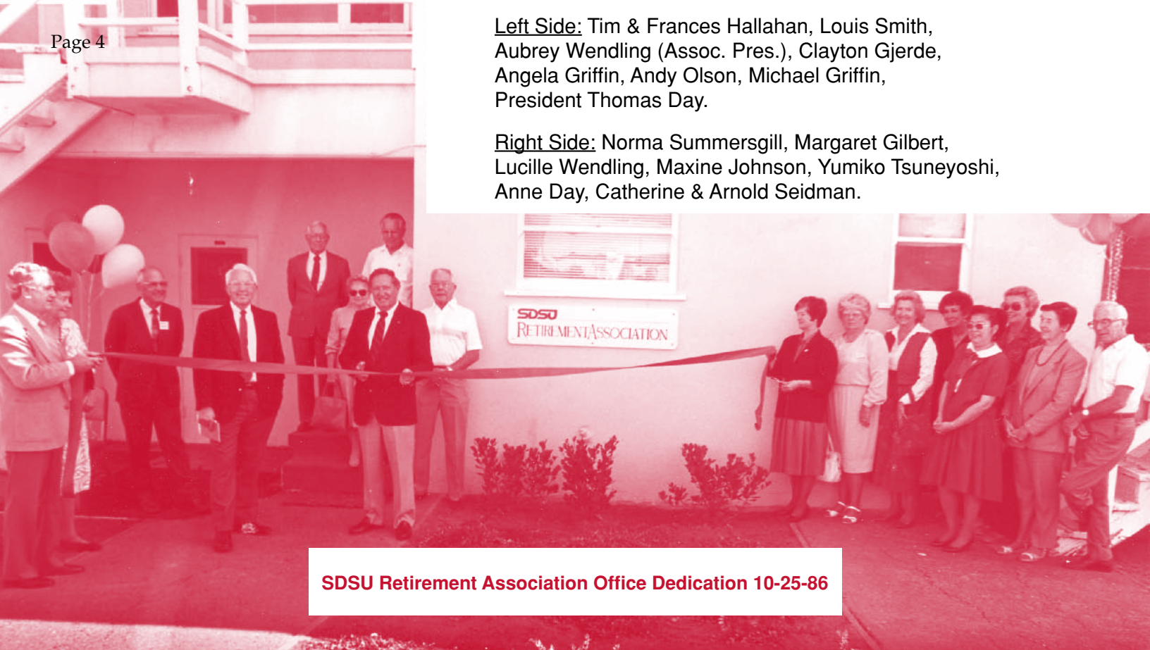
SDSU Retirement Association Office Dedication 10-25-86